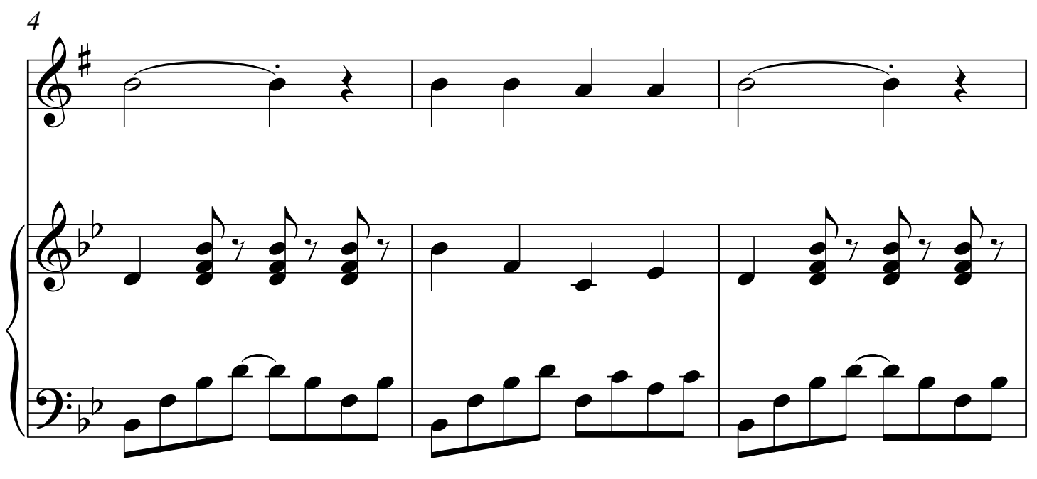
Copyright © 2016 by CMC Publishing All Rights Reserved